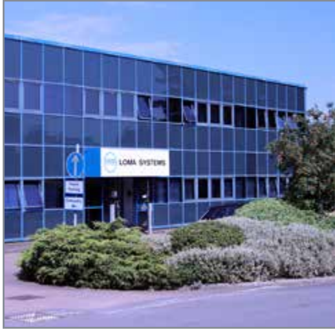
Farnborough, UK - Head Office

Headquartered in the UK, LOMA SYSTEMS operates from several locations in the Americas, Europe and Asia. Across these sites LOMA conducts ongoing research and development, specialised manufacturing, sales and service support. Through a worldwide network of OEM and distributor partners, LOMA supplies and supports inspection equipment in over 100 other countries.