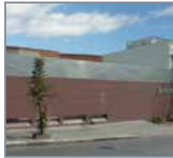
Sao Paulo, Brazil